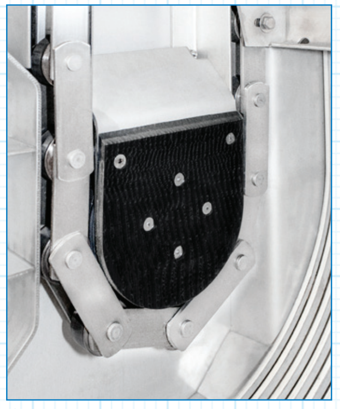
A Option 1 Heavy-duty stainless steel chain and lower guide rail engagement system