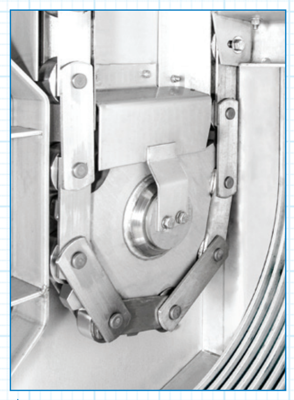
A Option 2 Heavy-duty stainless steel chain and lower sprocket engagement system